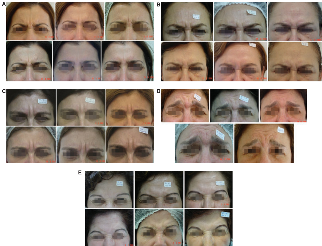
Figure 6. (A–E) Patients with each of the five contraction patterns (“U,” “V,” “converging arrows,” “omega” and “inverted omega”) after multiple botulinum toxin treatment sessions. Each photograph was taken when the patient returned for a new application.

muscle be injected, in addition to injection into the corrugators and the medial portion of the orbicularis oculi pars palpebralis. In cases of an inverted omega contraction pattern, the highest toxin doses should be injected into the procerus, depressors supercillii, and nasalis muscles, rather than the corrugators, because in these patients, the approximation between the eyebrows is less significant than the proximal depression. If corrugators are injected like in other patterns, the result will be a greater distance between the eyebrows and enlargement of the glabella. There is no consensus in the literature about the depressor supercillii being an independent muscle or part of the corrugator or orbicularis muscles, 32 but we consider it important to mention