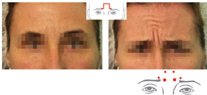
Figure 4. The omega type of contraction showing simultaneous approximation and elevation of the glabella and its corresponding injection sites.

glabellar muscle. 27 In this group, there is less participation from the corrugators. It seems to be seen more often in patients with a flat nose apex. The most appropriate treatment would be higher doses injected into the procerus and depressors supercillii and additional sites at the internal portion of the orbicularis oculi pars palpebralis and nasalis muscles. A minimal dose may or may not be injected into the corrugators (Figure 5).