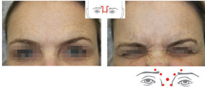
Figure 5. The inverted omega example showing predominance of depression and no approximation of the eyebrows and the suggested treatment sites.

depressing it (depressors) control facial expression. These muscles originate in the bone or at the superficial fascia, insert into the skin, 29,30 and are closely associated with each other, with synergic and antagonist activities. 31 During contraction, muscles follow force vectors that generally run from their insertion (mobile portion of the muscle) to their origin (fixed portion of the muscle), 29,32 determining hyperkinetic lines perpendicular to the contraction's direction and resulting in unaesthetic horizontal, vertical, and oblique wrinkles. 3 Table 1 summarizes the anatomy (origin, insertion, and direction) of the muscles influencing the contraction patterns of the glabella.