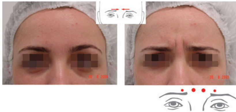
Figure 3. A case of brow opposer or converging arrows pattern with predominance of horizontal movement and the suggested injection sites.